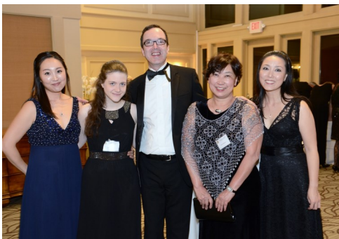
GSU piano students at the 2015 Chopin Gala